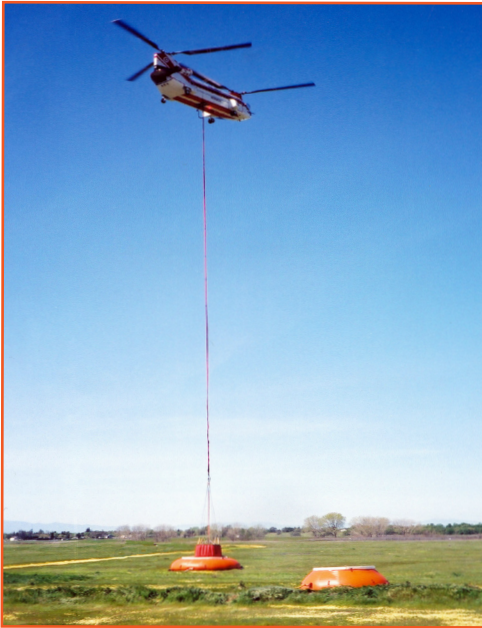
The Torrentula PowerFill is ideal for filling buckets from dip tanks such as the Fireflex Pumpkin Tank shown here.

ADD RAPID SHALLOW-FILL CAPABILITY TO YOUR TORRENTULA VALVE