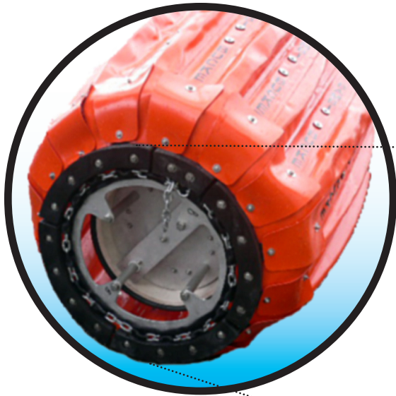
BAMBI BUCKET WITH AQUALANCHE VALVE INSTALLED

MULTIPLE WATER DROP CAPABILITY FOR SMALLER BAMBI BUCKETS